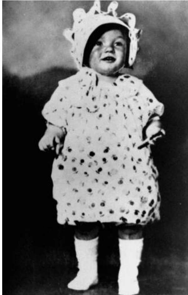
Marilyn Monroe is pictured here in her childhood days, in 1928.

After she became a star across the United States, fans learned the story of her unhappy childhood. The contrast between her difficult and humble beginnings and her glamorous lifestyle as a star made Monroe even more appealing to her fans.