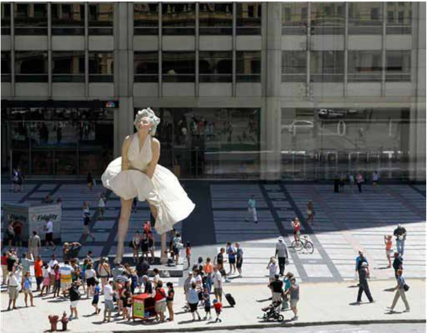
Seward Johnson's 26-foot-tall sculpture of Marilyn Monroe