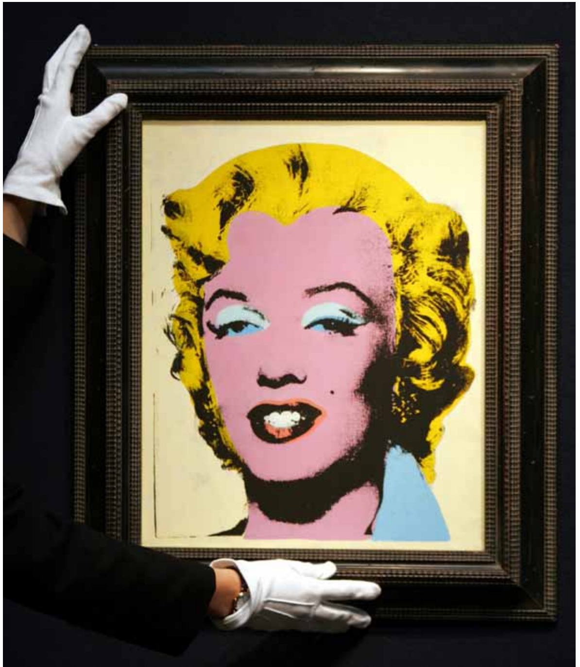
An Andy Warhol portrait of Marilyn Monroe called 'Lemon Marilyn', 1962