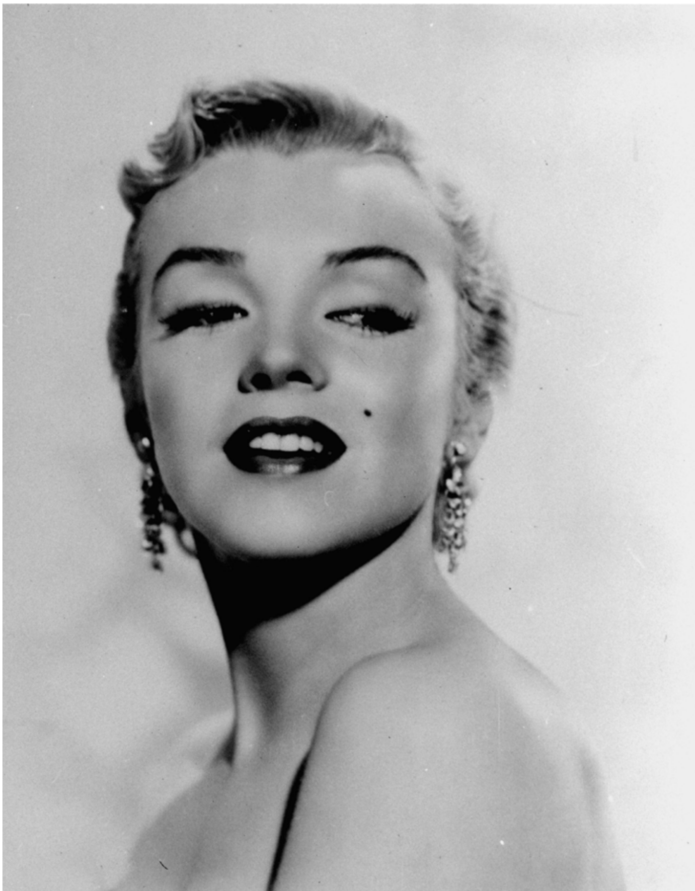
Marilyn Monroe is shown in this September 1950 photo.