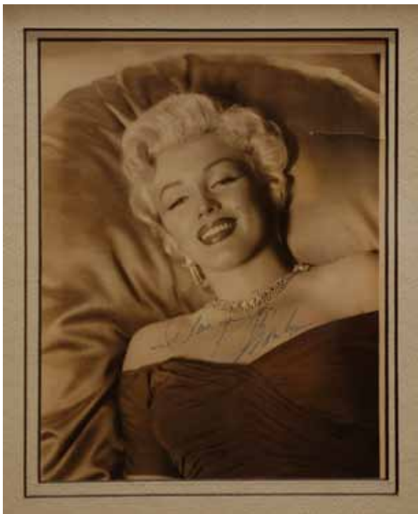
A signed Marilyn Monroe photograph that reads "I love you Joe" from the personal collection of Joe DiMaggio.